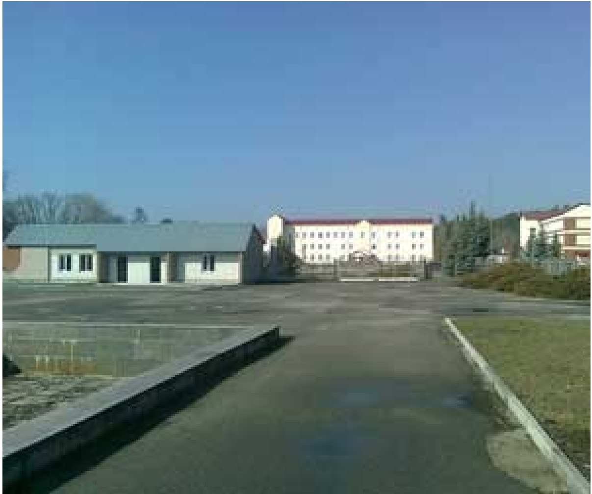
An area is before building of about 300 м2.