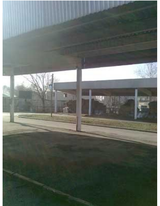
Cover №3 has length about 20 m.