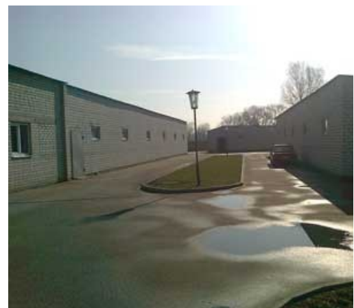
Sidewalks (paths) are with an asphaltic surface.

Sidewalks are designed for smooth travel and entrance on the territory of passenger cars (and vans) making them as comfortable for exhibition equipment.